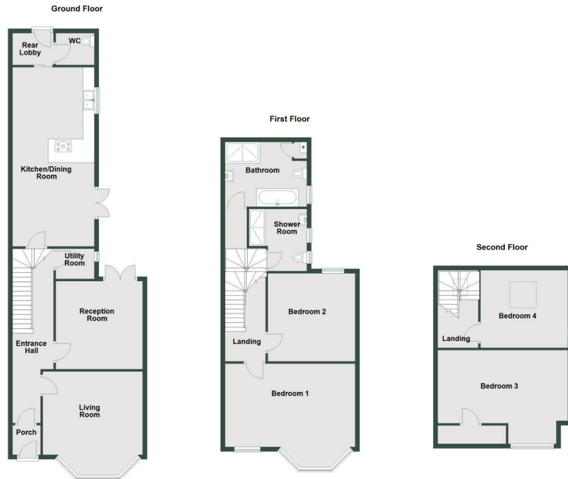
Total area: approx. 197.8 sq. metres (2129.3 sq. feet) 8 Paget Place